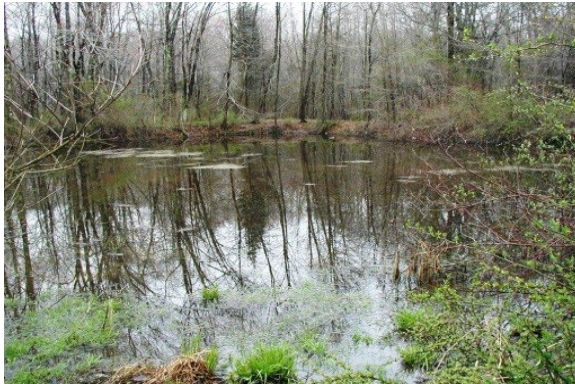
Seasonal Pond near Newton Road