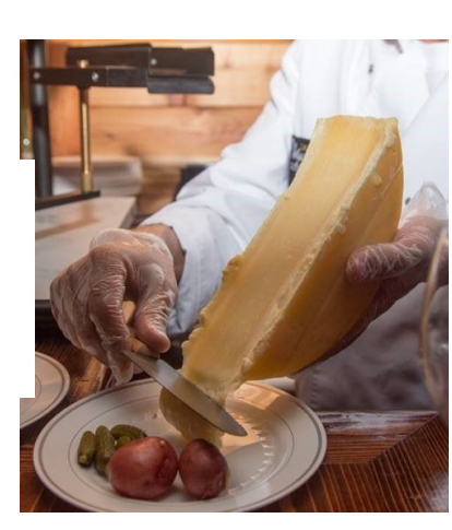
Au Chalet opens in New Haven

Amazon purchases former Pratt & Whitney site with 1800 jobs expected in 2018