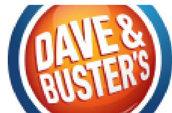
Dave & Busters coming to Milford