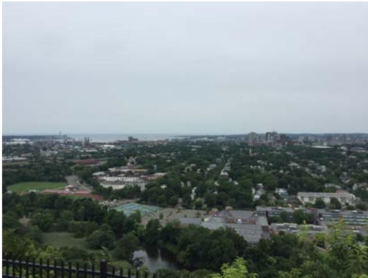
View from East Rock summit