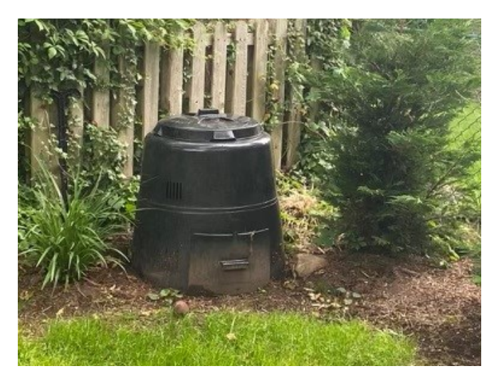
Backyard Composter sold at SCRCOG's Regional Backyard Composting Sale event.

SCRCOG held the first Regional Backyard Composting Sale within the SCRCOG region in April 2021. Residents purchased over 200 backyard composters, over 60 rain barrels and other accessories on-line. During the last week of April, residents picked up their merchandise at one of three pickup locations in the Towns of Woodbridge, Hamden, and Guilford.