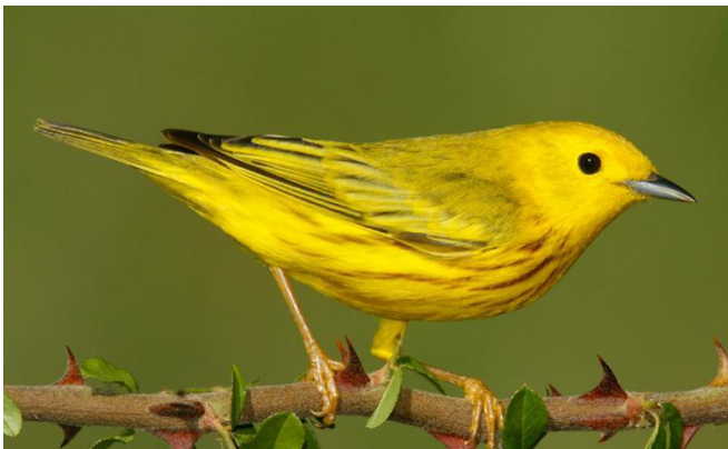
American Yellow Warbler

Leashed dogs are welcome when outside the fenced dog park area.