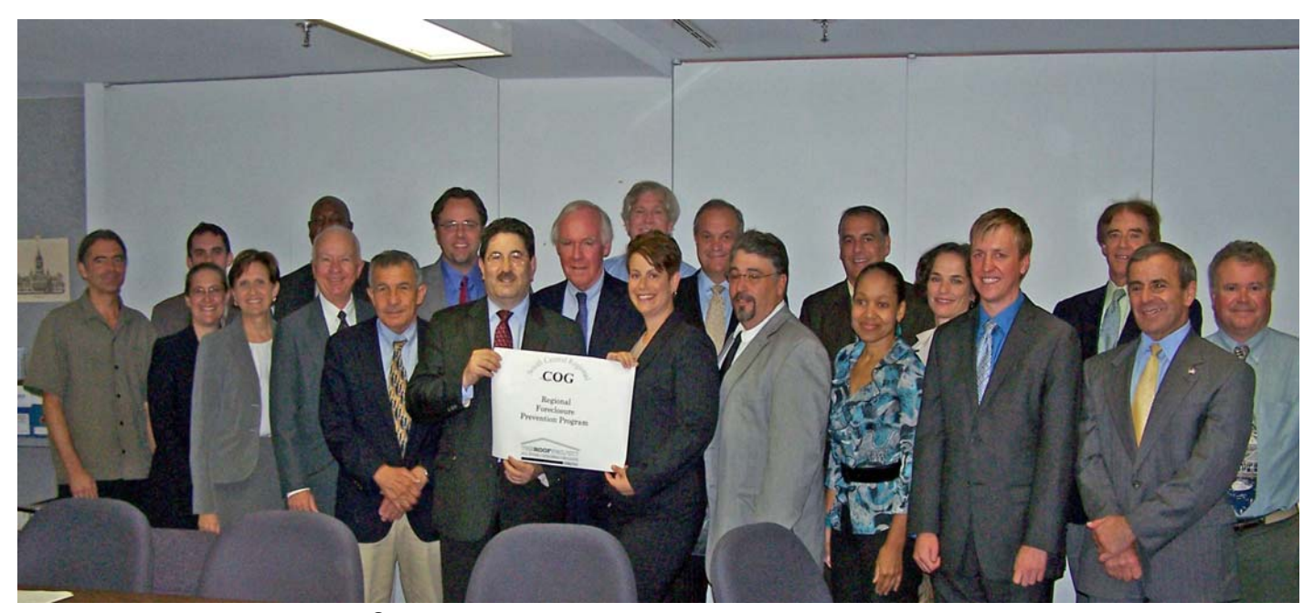
Photo: Regional ROOF Project Launch @ SCRCOG Offices, 9-28-11

Please visit www.theroofproject.org for additional information.