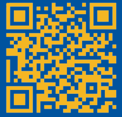
Regional Planning Commission Webpage

A more detailed description of the Commission’s statutory responsibilities can be accessed using the QR code to the top right. Additional information about the Commission, including a downloadable referral submission form and instructions for submitting referrals, can be found on the RPC webpage, accessible using the QR code to the bottom right.