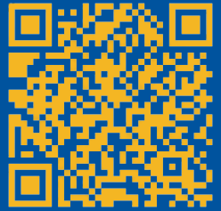
Matrix of Statutory Responsibilities

A voluntary RPC review for informational purposes only; an RPC resolution is not necessary.