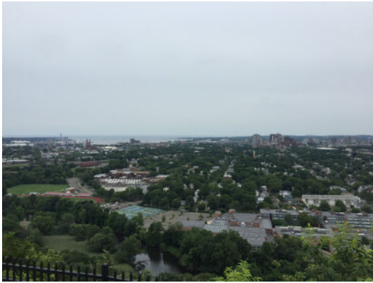
View from East Rock summit