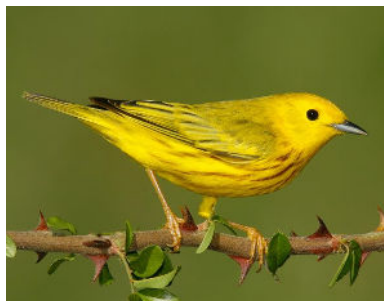
American Yellow Warbler

Leashed dogs are welcome when outside the fenced dog park area.