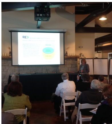
Shoreline Economic Development Summit