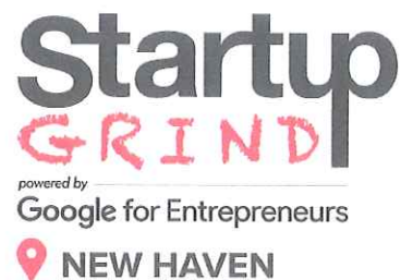
8/16 Ben Berkowitz See Click Fix