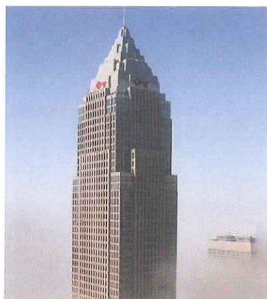
Key Bank Meeting Cleveland, OH