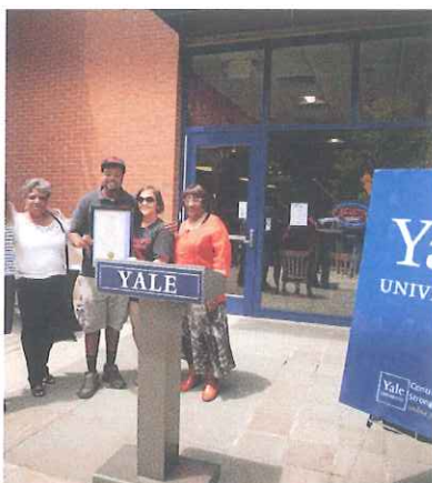
Ribbon Cutting Ricky D's at Science Park

435 Foxon Road North Branford, CT 06471 3,247 SF Office For Sale