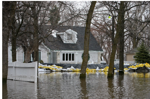
Floods happen in Connecticut

The planning process is as important as the plan itself. It creates a framework for risk-based decision making to reduce damages to lives, property, and the economy from future disasters.