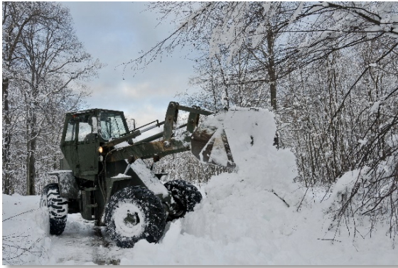
Severe Winter Storms impact Connecticut

in the development of the Plan. The Advisory Committee meetings will allow for valuable input from the stakeholders and will keep them apprised of project progress.