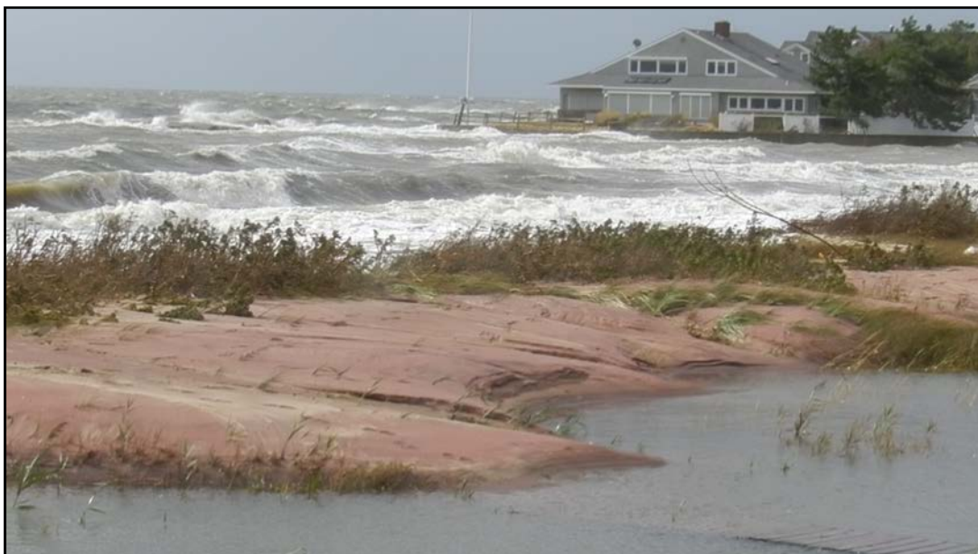
Natural Infrastructure defending the coast against waves during Storm Sandy (Madison, Connecticut)

Another challenge in designing sea level rise adaptation zoning regulations is to avoid instances of “taking” in which a government seizes a property or, more likely with zoning, adversely affects the value of a property through regulation without just compensation to the owner. For example, regulations under a new overlay may seek to prohibit rebuilding after a storm; or setback requirements may leave an owner without space on the property to rebuild. Courts may rule these scenarios as takings. Typically, the Connecticut courts have ruled against zoning regulations when a taking results in a substantial decrease in economic value to the land owner. 17 However, the U.S. Supreme Court has left room for an owner’s loss of economic value to be balanced against the public good. 18 19