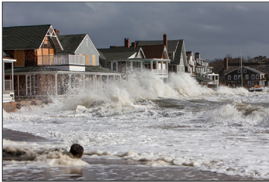
Storm Sandy striking Middle Beach Road in Madison, CT.