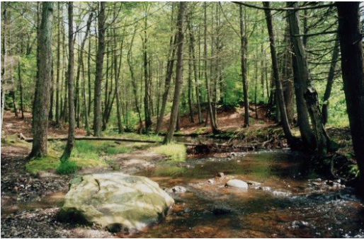
Indian River near Paul Ode Trail