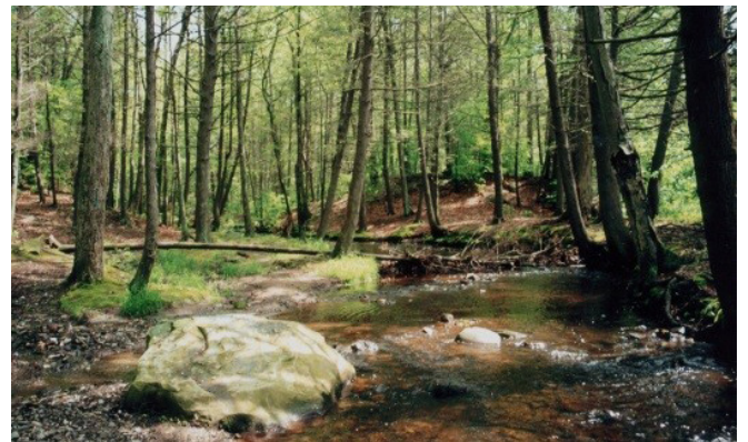
Indian River near Paul Ode Trail

Biking is prohibited in both locations. Dogs are permitted on leash. Dog waste stations are located in various locations at the High Plains Community Center. Please bag and pick up all dog waste.