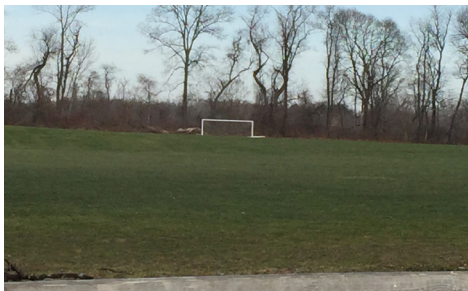
Soccer Field at Fred Wolfe Park

The trail is through a mixture of immature growth and mixed hardwoods. The trail heads in a northerly direction and emerges into a field cultivated by a local farmer. A stone spear point was found here soon after the Town purchased the area in 1996. The trail follows along the edge of the field and then turns left to return to the parking lot around the soccer fields.