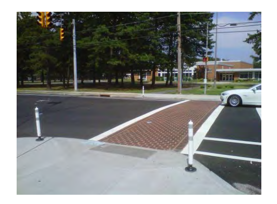
Time Frame: Medium Term (4 - 6 months)